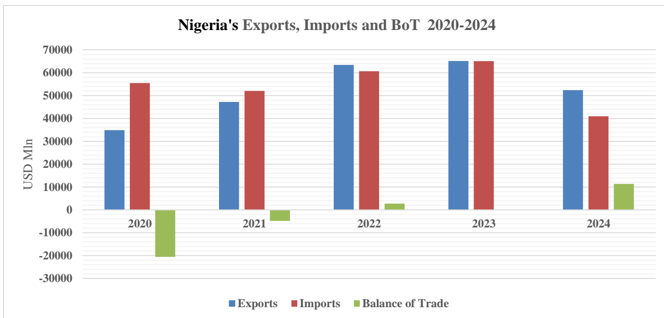
Figure - 1